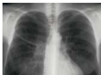
With DICOM simulation mode