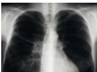
Without DICOM simulation mode

On-site calibration giving full DICOM 14 compliance can be achieved using the AcuScreenPRO system, available separately from our partner Larivière GmbH. Environmental factors, such as the intensity and tone of ambient light, plus the projection screen type, are all taken into account to achieve the very best possible image quality.